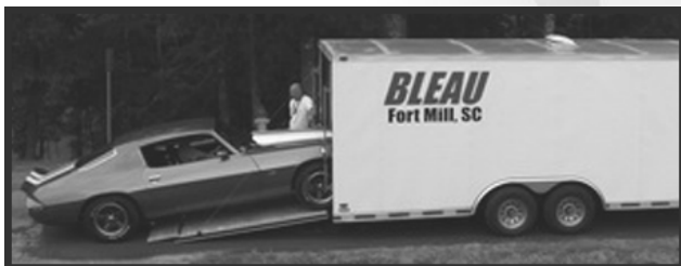
1970 Z-28 Camaro, 2010 Best Under the Hood

After April 30 th (or day of show) registration is $20 per vehicle.