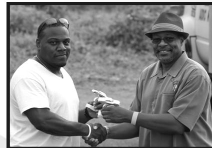
2010 Best Custom and Kids' Choice Winner