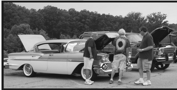
1958 Chevy Bel Air, 2010 Best in Show