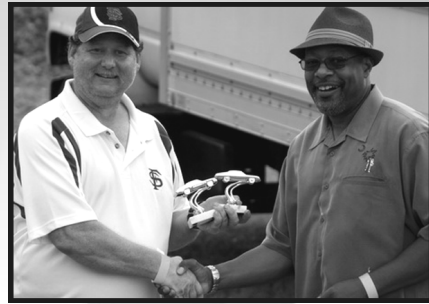
2010 Best Truck and Best Interior Winner